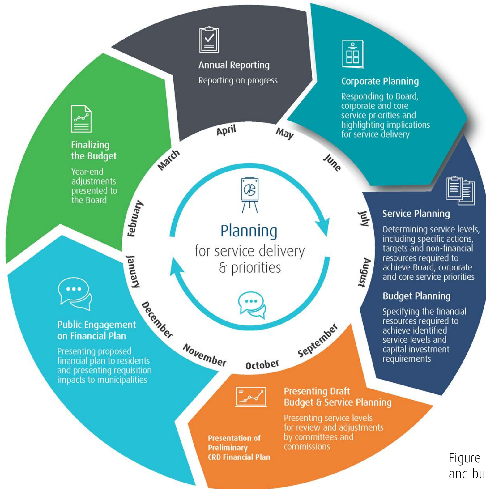
Figure 1. CRD's service planning and budget planning cycle