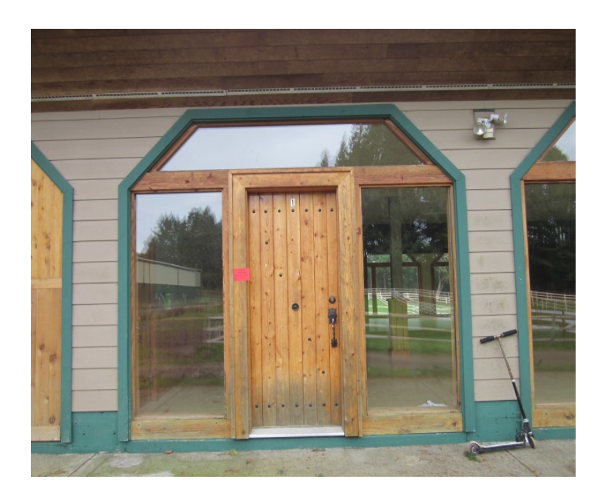
Building #5: Tractor shed. Tractor storage area eliminated. Currently vacant.