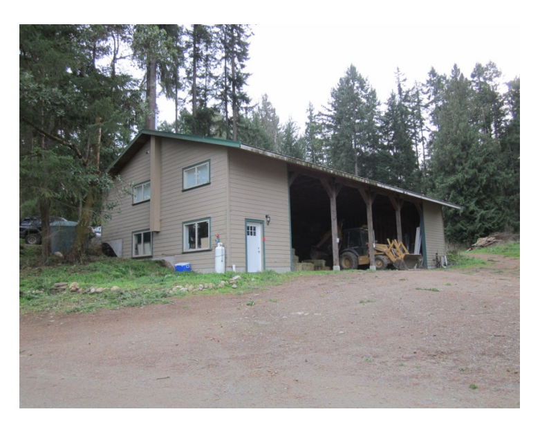
Building #1: Hay barn altered to include dwelling unit. Unknown fire separations.