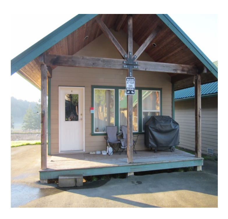
Building #3: Second tack shed converted to a dwelling.