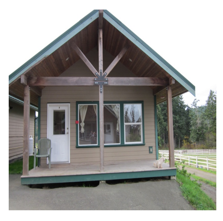
Building #2: First tack shed converted to a dwelling.