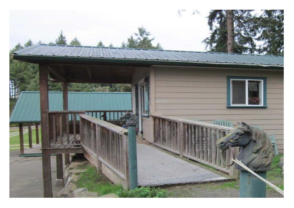
Building #6: Washroom building. Alterations to interior, converting to a dwelling.