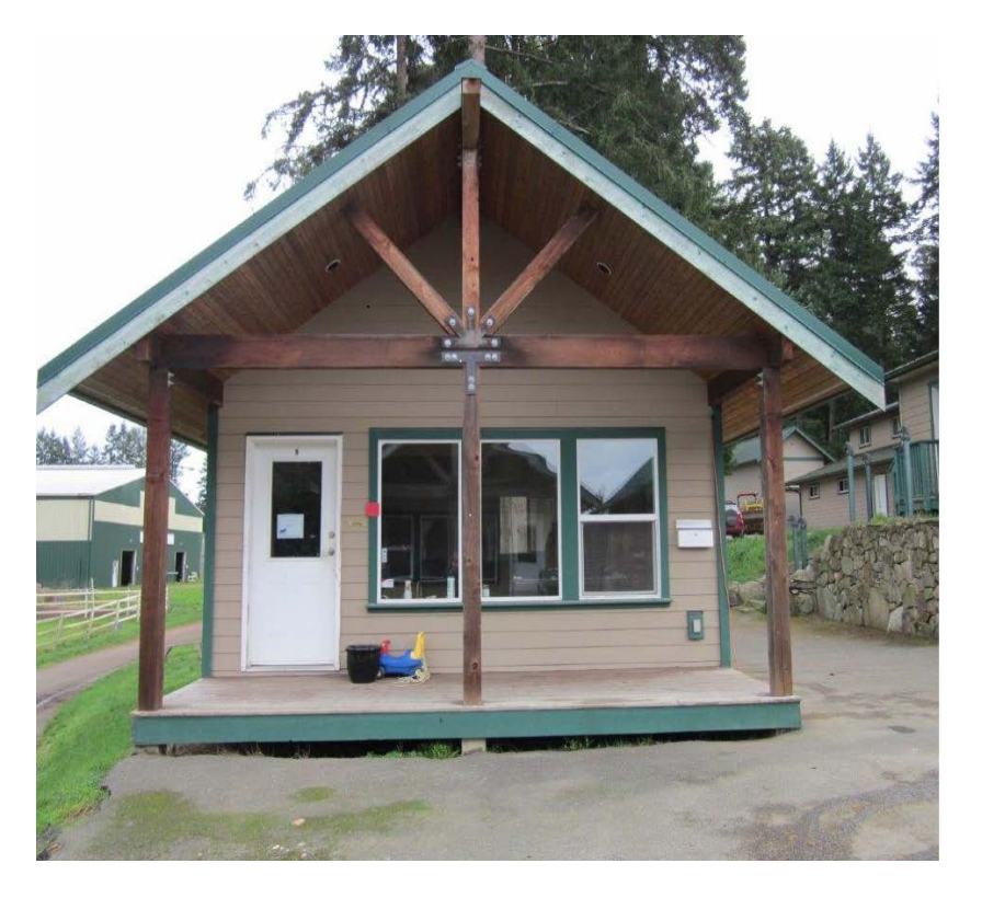
Building #7: Third tack shed converted to a dwelling.