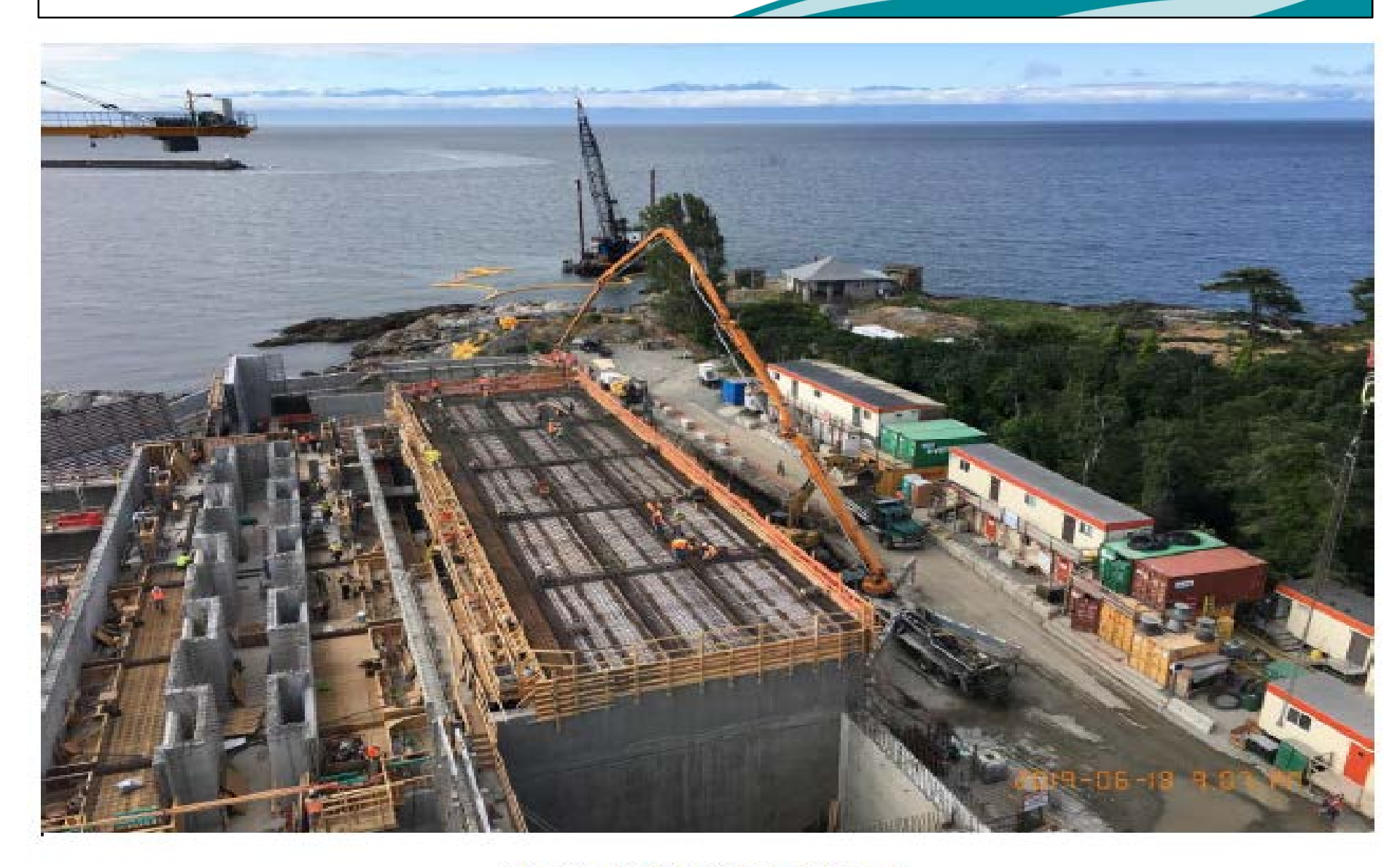
View to SW from Tower Crane B