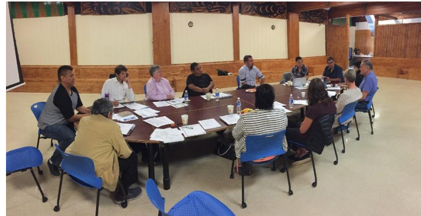
Members Train in Archaeological and Cultural Monitoring