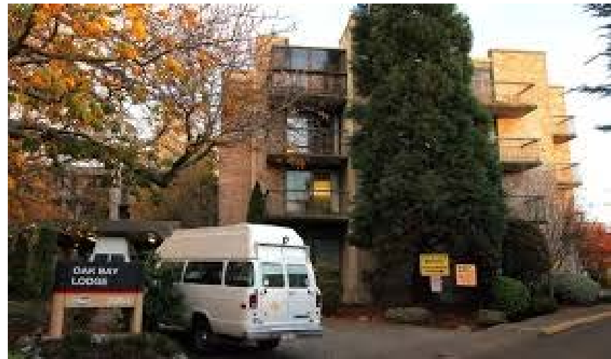
Oak Bay Lodge