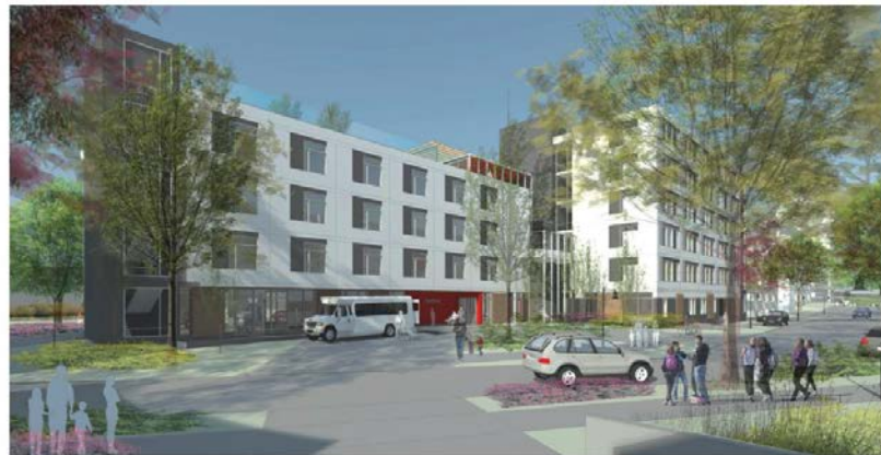
Non-Traditional Project: Nigel House