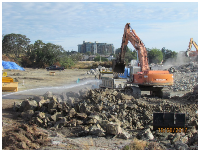
Figure 5 – Loading blast rock on to trucks and hauling to area A