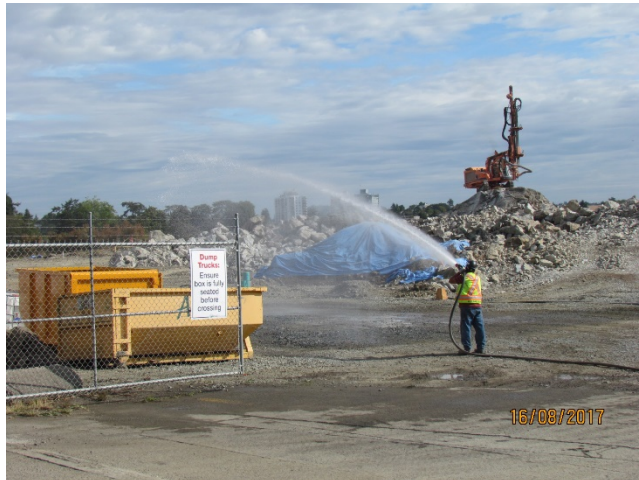
Figure 4 - Maintaining dust control on site