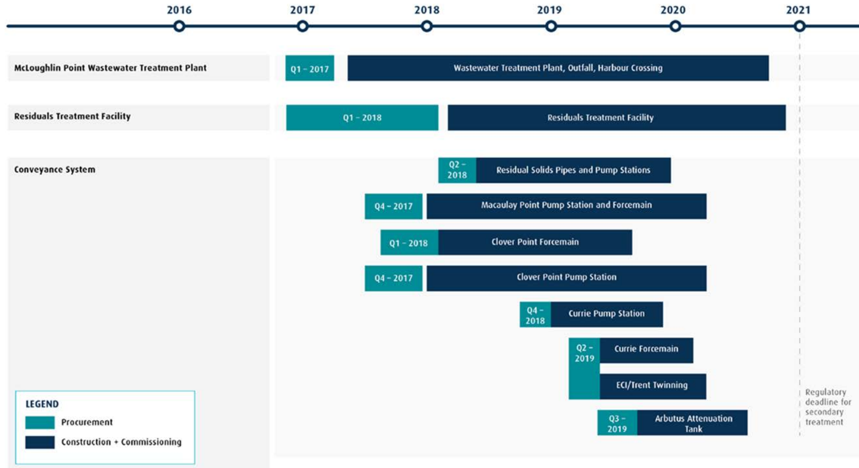
Figure 1-High-Level Project Schedule 1