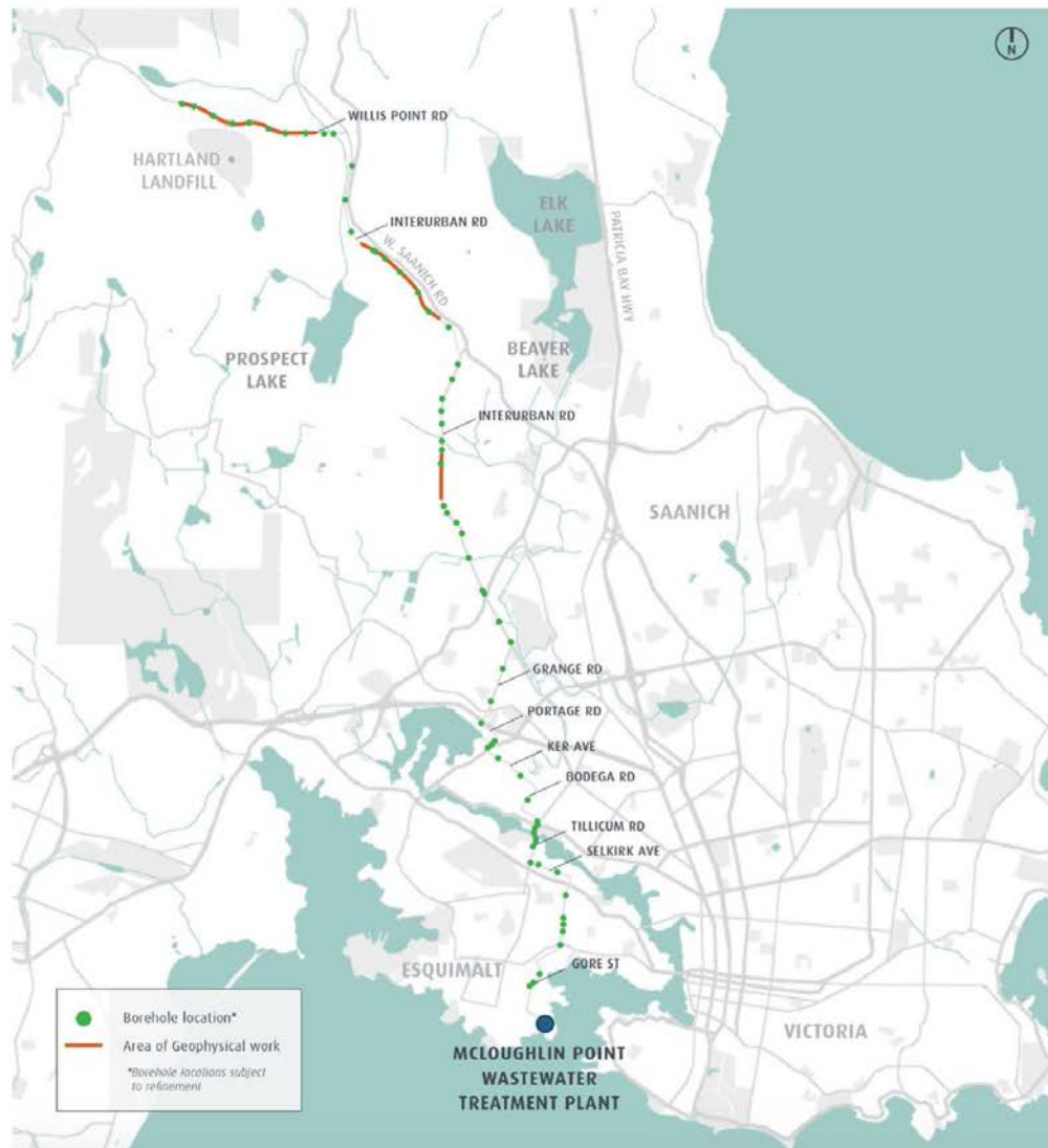
Map of proposed areas of geotechnical and geophysical work:

To learn more about the Wastewater Treatment Project, or to sign up for construction updates, please visit wastewaterproject.ca . To contact the project, please email wastewater@crd.bc.ca or call 1.844.815.6132.