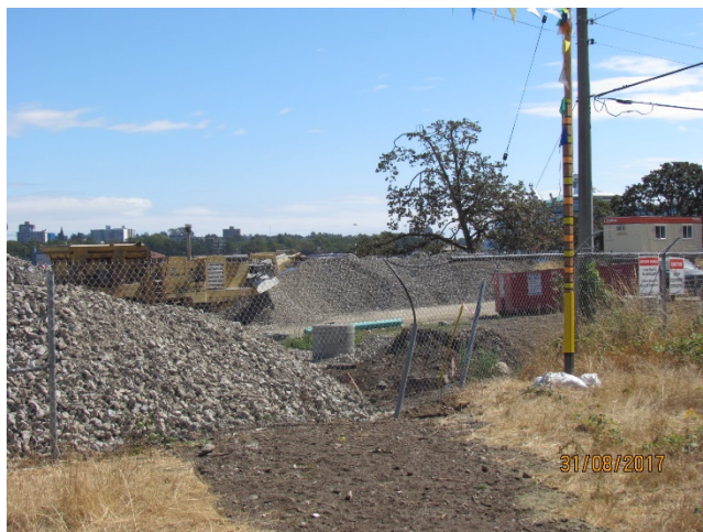
Figure 6 – Crushed blast rock in area A