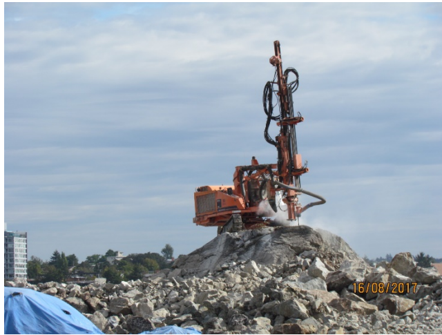
Figure 2 - Drilling of rock outcrop

At Ogden Point the drilling of the HDD pilot hole continued and reached 337m across the harbour by end of the August.