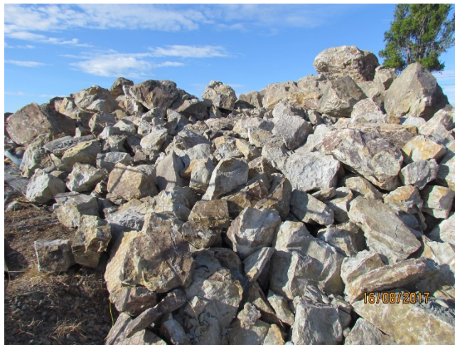
Figure 3- Blast rock