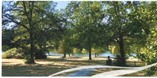
Elk/Beaver Lake Regional Park offers outdoor opportunities for everyone.