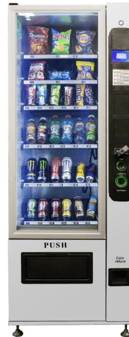
Combo VC 7206-5C