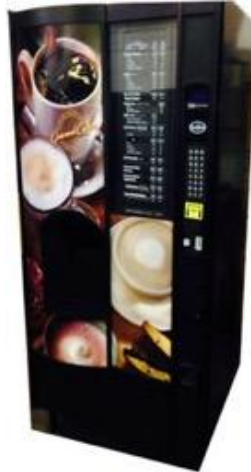
Refurbished Crane 673 $4,789