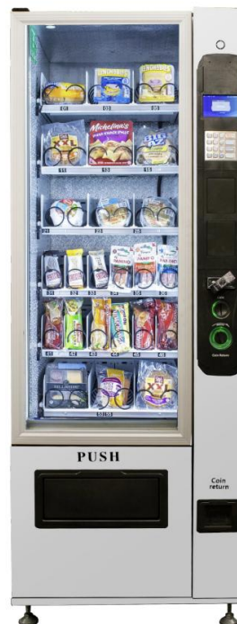
Food VC 7206-5F