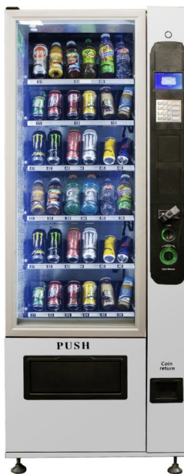
Drinks VC 7206-5D