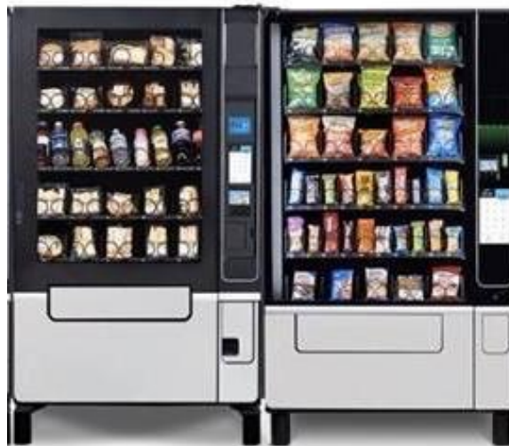
Combo Evoke Elevator