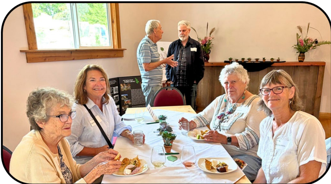
2025 Donor Appreciation Event